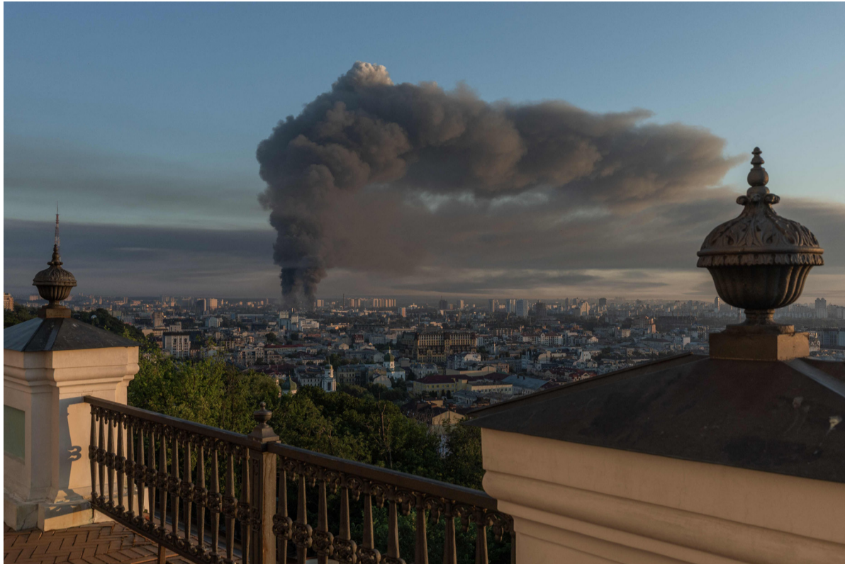
Smoke rises over the city following a Russian air attack on Kyiv on Thursday, amid the Russian invasion of Ukraine

"During the night, the enemy once again launched a massive attack on the Kyiv region using strike drones, ballistic missiles and