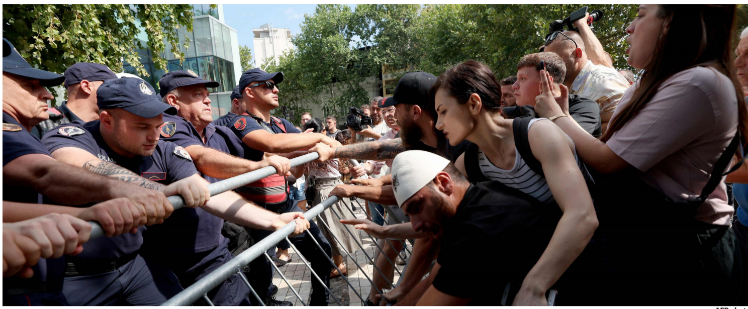
Protesters try to remove a metallic barricade as violent clashes erupted between police and demonstrators on the sidelines of a demonstration against a controversial luxury resort development linked to US president near a protected natural area, outside the parliament, in Tirana, on Thursday

Lines of riot police pushed them back, leading to clashes and