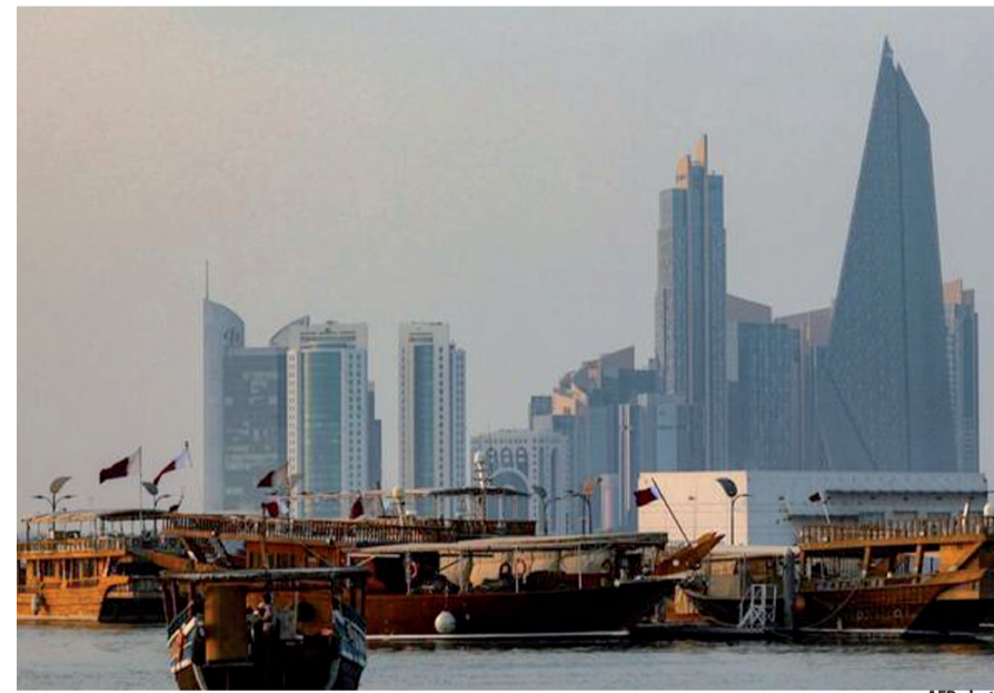
US and Iran negotiators made 'positive progress' during indirect talks in Doha, Qatar's foreign ministry spokesman said

"The parties agreed to continue discussions over the coming period, with the next meeting to be scheduled at the earliest possible time following the funeral processions of the