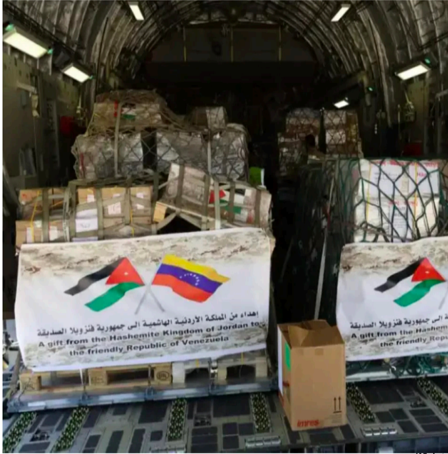
Under Royal directives, Jordan on Thursday dispatches relief, medical and food assistance to Venezuela, in cooperation with Qatar, to support those affected by the double earthquake that struck several areas of the country

to strengthen the capacity of the relevant authorities to respond