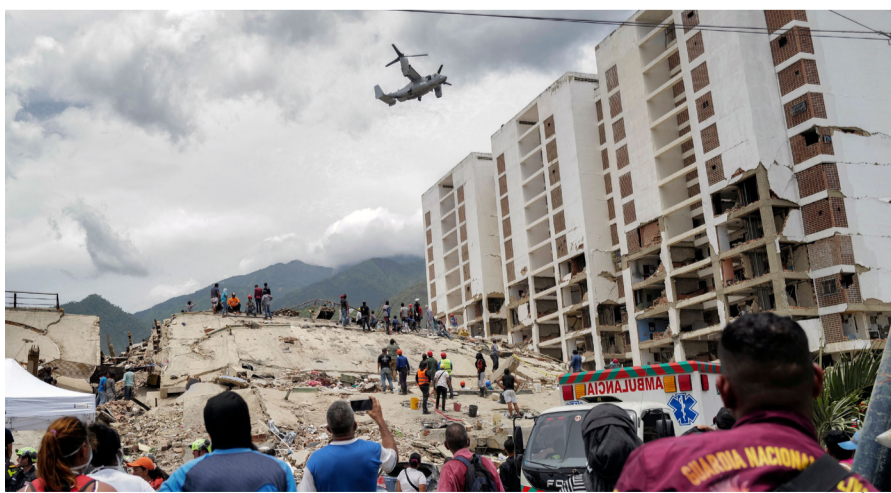
An Osprey aircraft overflies a quake-hit area in Caraballeda, La Guaira State, Venezuela on Sunday, following twin earthquakes

The majority of collapsed buildings in the hardest-hit city of