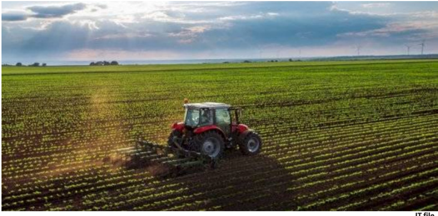
Minister of Agriculture Saeb Khraisat says on Thursday that 19 companies have exported agricultural products under the government's agricultural export support programme