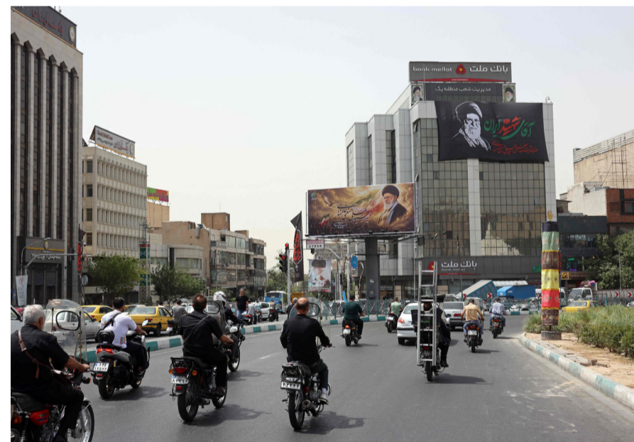
Commuters drive past giant billboards bearing photo of Iran's late supreme leader Ayatollah Ali Khamenei ahead of his funeral, in Tehran on Thursday

mediators concluded separate meetings with the US and Iranian negotiators in Doha [Wednesday], with positive progress made," the two mediating nations said in a statement on Thursday.