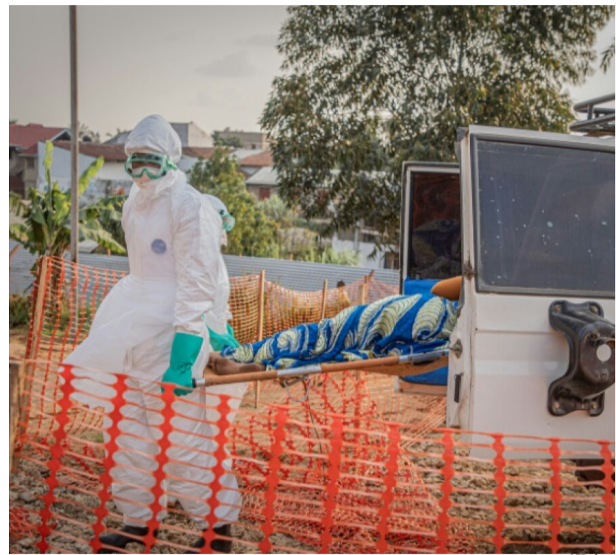
The highly infectious disease has claimed 438 lives among the 1,406 people confirmed infected since May 15, the National Institute of Public Health said

The body of a deceased Ebola victim remains highly infectious and in many cases the virus has been transmitted during burial rites.