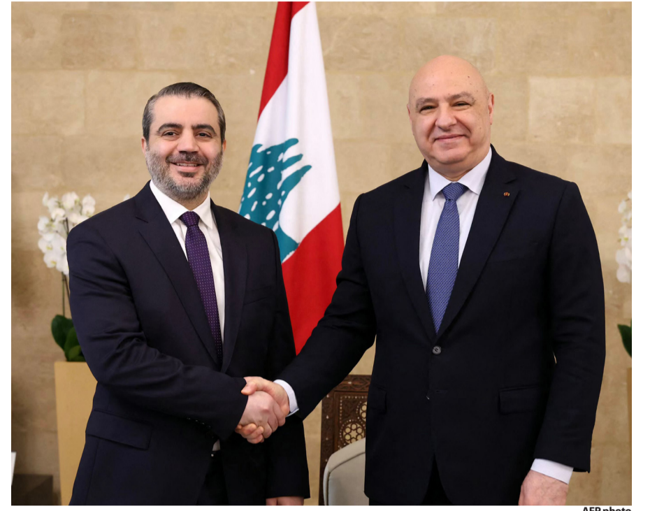
This handshake photo released by the Lebanese Presidency press office shows Lebanon's President Joseph Aoun (right) meeting with Syria's Foreign Minister Asaad Al Shaibani at the presidential palace in Baabda on Thursday