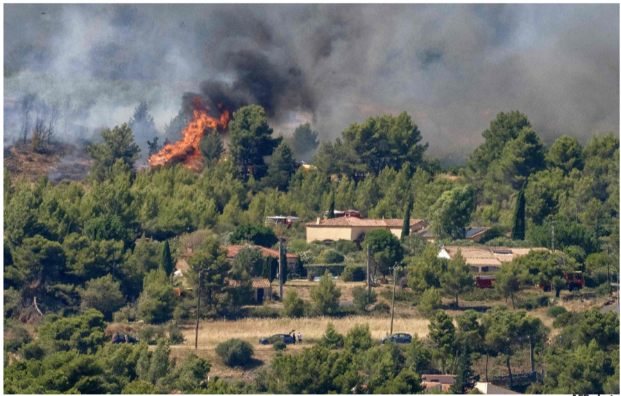
This photo shows a wildfire raging near houses in Pouzols-Minervois, south-western France, on Thursday