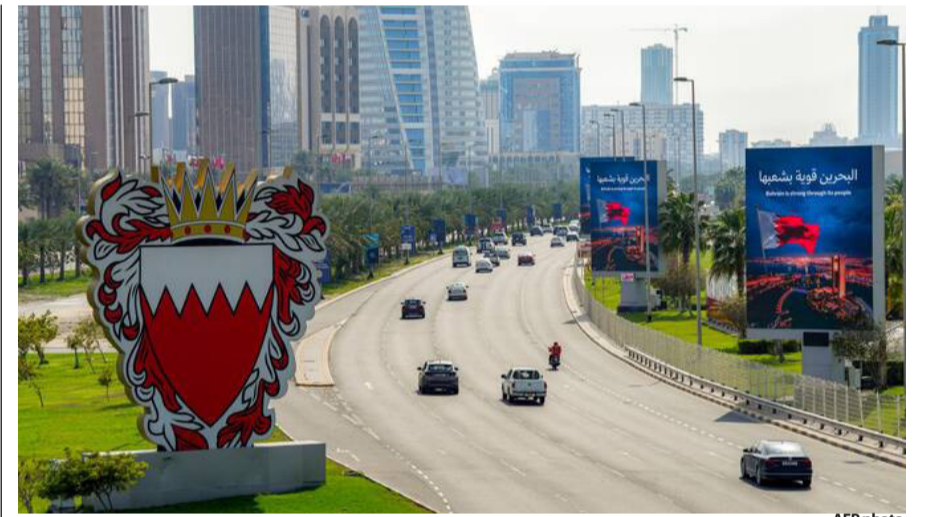
Vehicles move on a road in Bahrain capital, Manama on March 11

The Crown Prince's interests include football, diving, adventure, shooting and cycling.