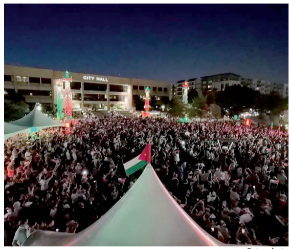
The Jordanian House attracts thousands of expatriates and international visitors on the sidelines of the 2026 FIFA World Cup

The pavilion also screens live World Cup