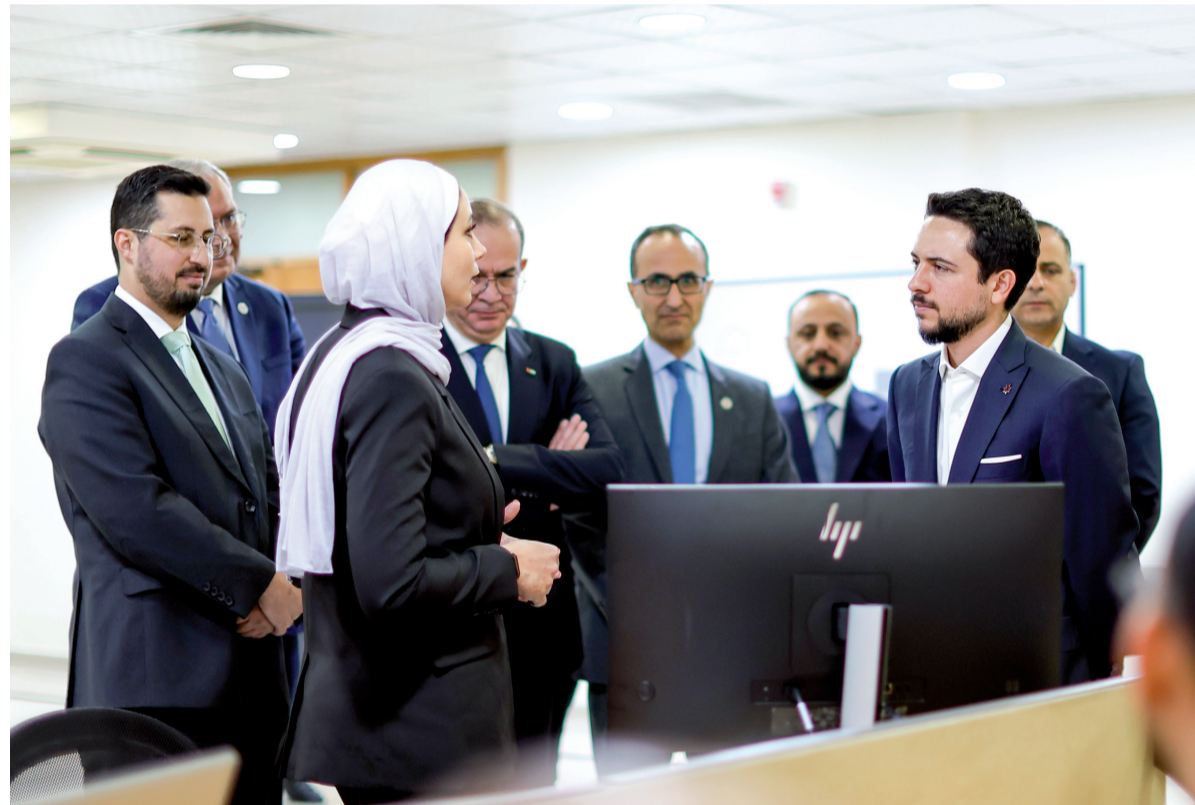
HRH Crown Prince Hussein, during a visit to the Ministry of Digital Economy and Entrepreneurship, meets with the Sanad application developers, and notes the importance of building on Sanad's success by expanding the government services it offers, thereby simplifying procedures for citizens

According to Smeirat, more than 83 per cent of government services eligible for digitisa-