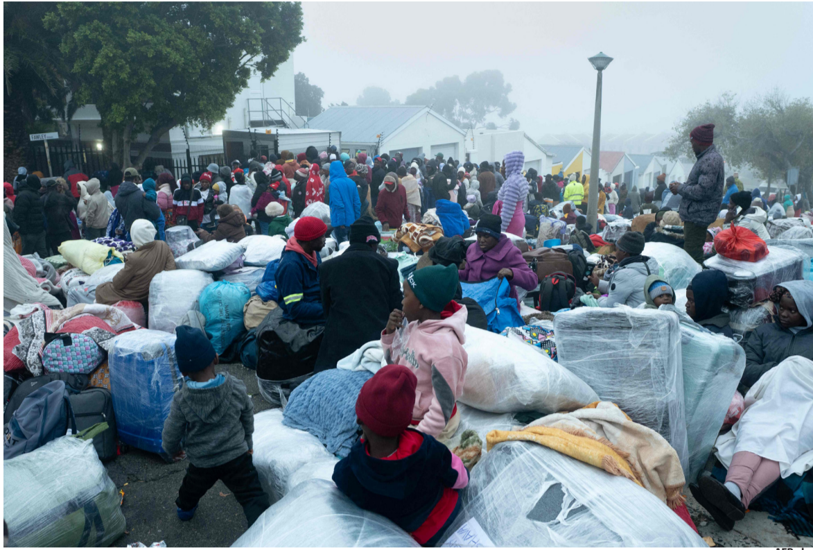
Hundreds of Zimbabwean migrants gather with their belongings outside the Zimbabwean Consulate in Cape Town, on Saturday

"To date, a total of 15,162 Malawian nationals have been processed for deportation and repatriation, and more are still undergoing the verifica-