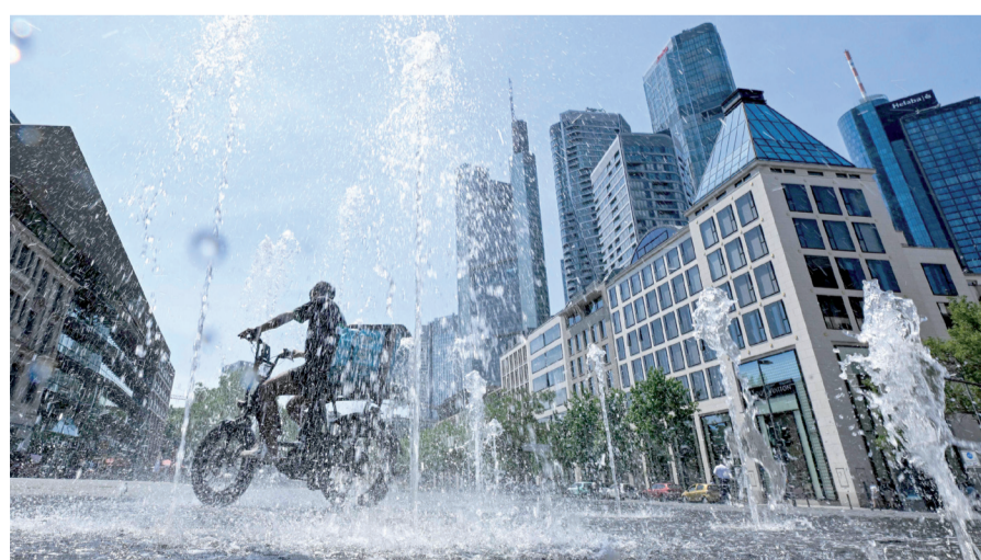
A man rides his bicycle through a fountain outside the banking district in central Frankfurt am Main, western Germany, on Friday with air temperature reaching 39°C

Scores of people have died either through heat-related illness or drowning accidents and emergency services in several countries have said their facilities are saturated.