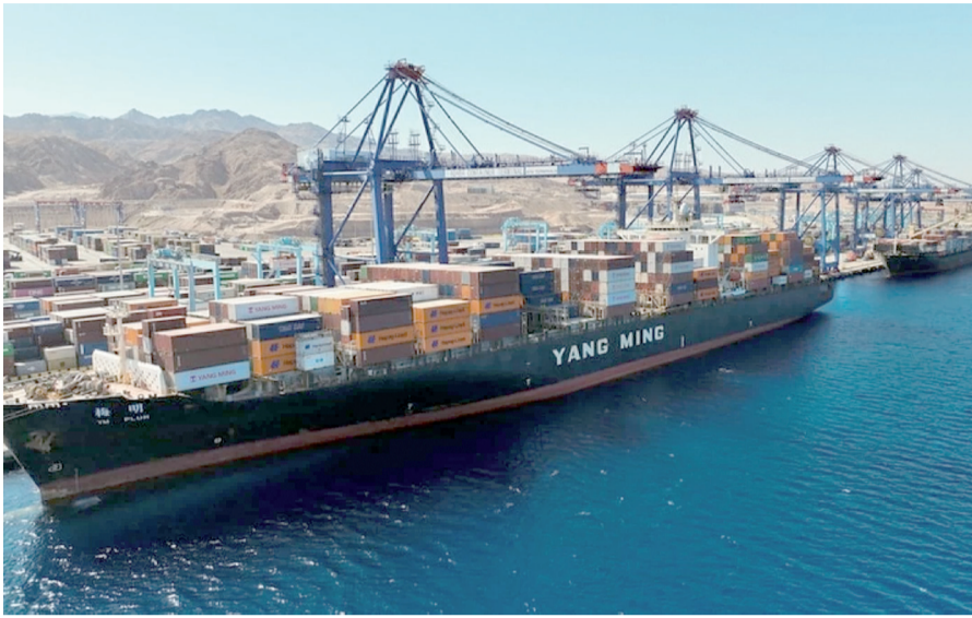
The Department of Statistics has released the latest foreign trade data for the first third of 2026, showing notable shifts in Jordan's export and import performance compared with the same period in 2025