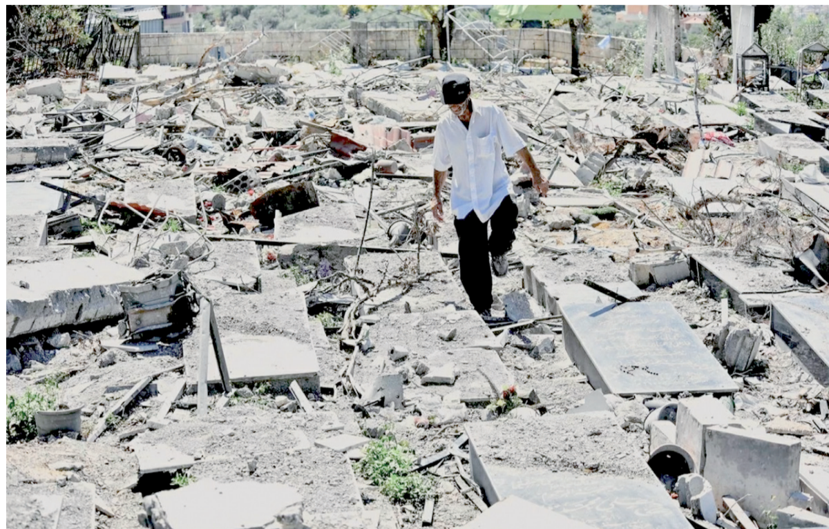
A man walks between damaged headstones, destroyed in Israeli military strikes, at the cemetery in the southern Lebanese village of Srafa on Wednesday

"Without firm Israeli commitments, many residents of the south may continue to face