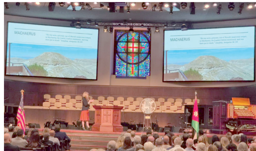
The Ministry of Tourism and Antiquities and the Jordan Tourism Board, in partnership with the First Baptist Church of Arlington, Texas, organise a promotional event titled 'Christian Faith in Jordan: Land of Revelation, Baptism and Pilgrimage'

The programme opened with a photo exhibition showcasing