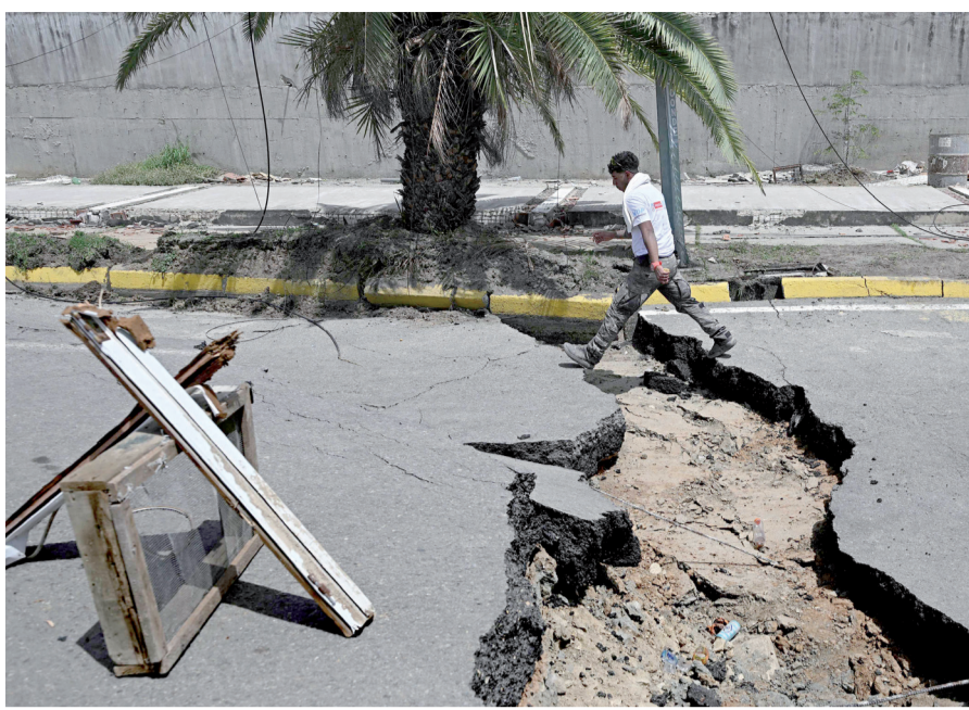
A man walks in a cracked street following a twin earthquake, in Los Corales, La Guaira state, about 38km northwest of Caracas, on Thursday