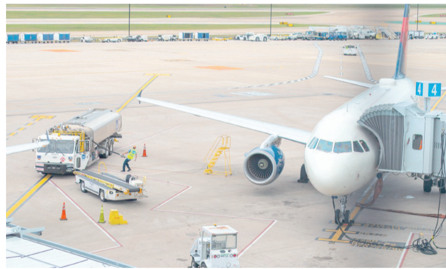
A technician prepares to refuel a Delta Airlines aircraft at the Austin-Bergstrom International Airport on April 10 in Austin, Texas

even with the pickup in maritime traffic through the strait it would take