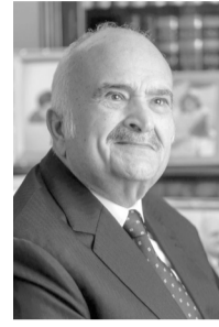
HRH Prince El Hassan Bin Talal

Australia's recent experience provides an important lesson for policymakers worldwide. In 2026, the Australian eSafety Commissioner published a compliance report three months after introducing legislation restricting social media access for users under sixteen. The findings challenged many assumptions. Nearly 70 per cent of children who previously held accounts on Facebook, Instagram, TikTok, and Snapchat continued accessing those platforms despite the legal restrictions. Many bypassed the rules by using VPNs, entering false birth dates, relying on existing accounts, or using their parents' identities. At the same time, several platforms continued applying weak age verification processes that failed to identify underage users effectively.