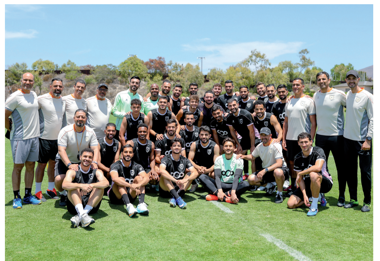
HRH Crown Prince Hussein on June 9 visits the Jordan national football team's base camp in San Diego, USA during their final training sessions ahead of the World Cup 2026

Similarly, Secretary-General of the Jor-