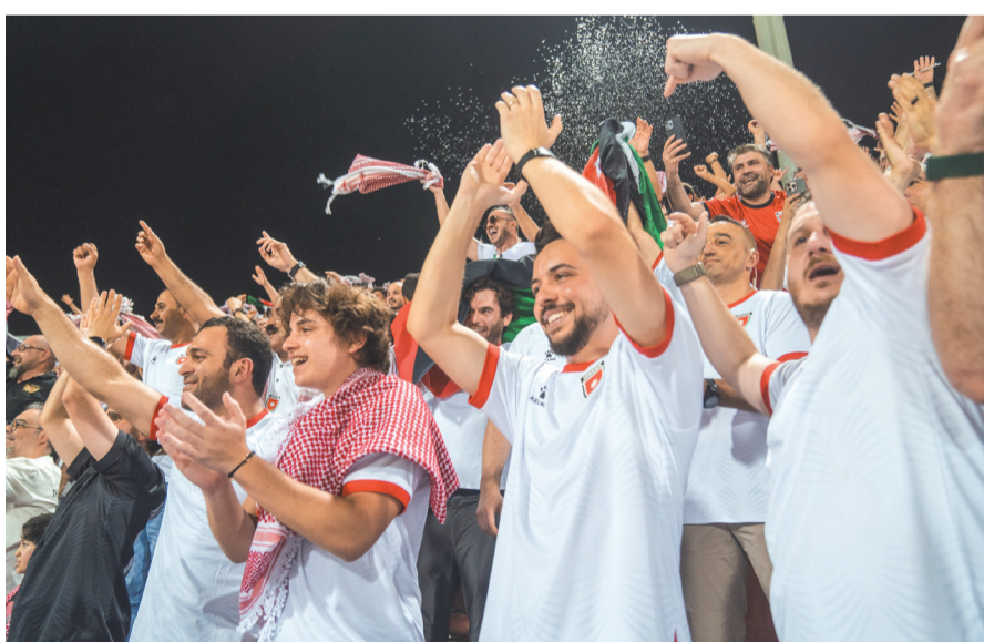
HRH Crown Prince Hussein on June 10, 2025 attends the Jordan national football team's match against Oman at Sultan Qaboos Sports Complex as part of the Asian Qualifiers for the FIFA World Cup 2026. His Royal Highness was accompanied by a number of Royal family members

In recent years, Jordanian sport has recorded a string of landmark achievements.