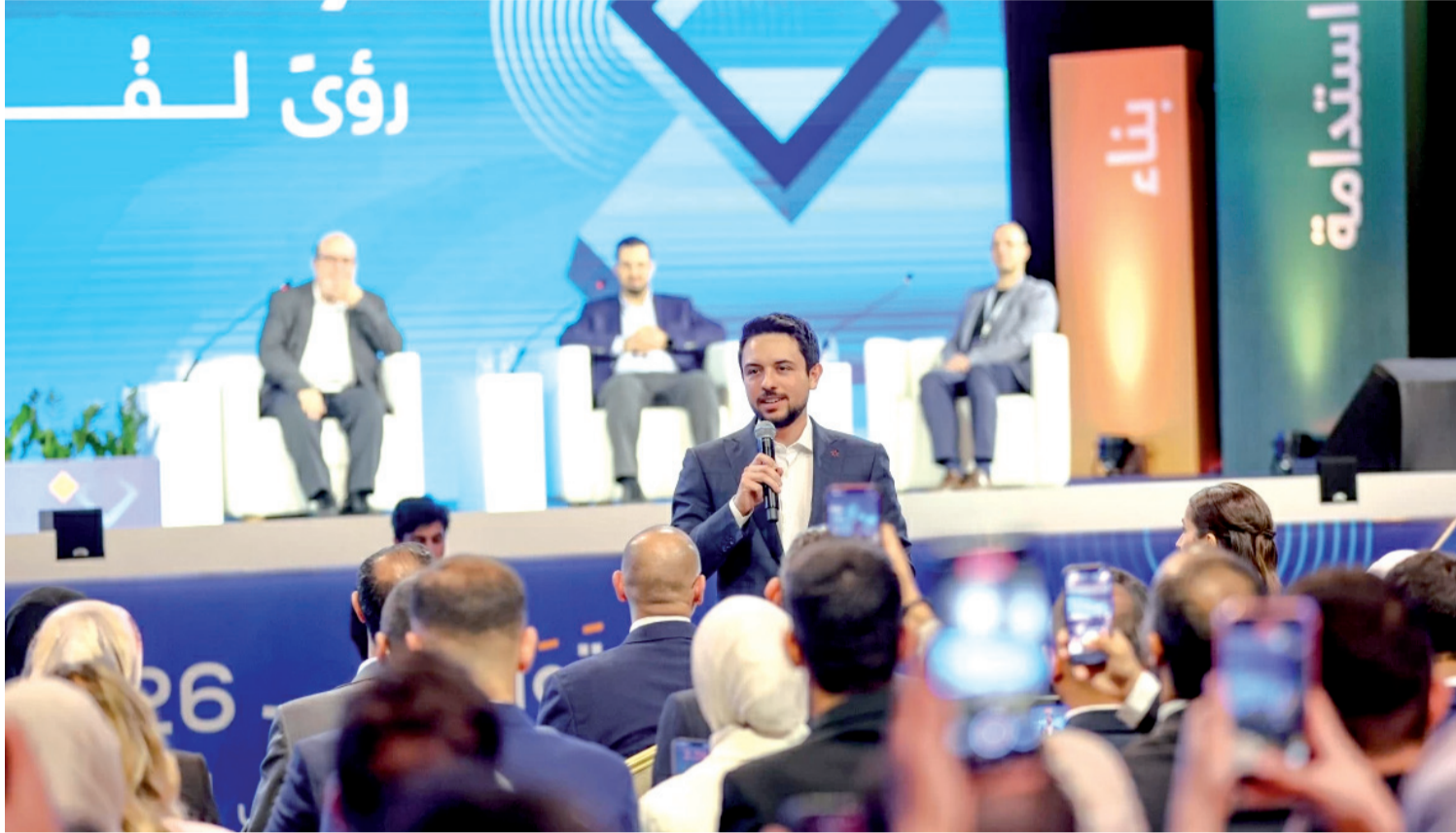
HRH Crown Prince Hussein speaks to participants at the Tawasol 2026 on May 16

ed several integrated government service centres across the Kingdom.