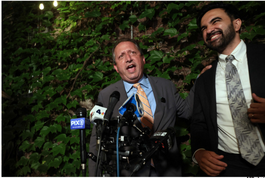
Democratic Congressional Candidate Brad Lander takes the stage with New York City Mayor Zohran Mamdani after winning the 10th District Democratic primary in Brooklyn on Tuesday, in New York City

ocratic Pennsylvania Senator John Fetterman called the results "a banner night, you know, for the dirtbag left in New York".