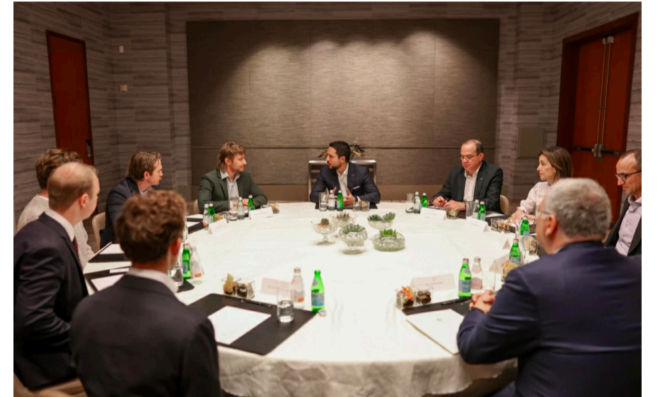
HRH Crown Prince Hussein meets on Tuesday with leaders of pioneering organisations in advanced technology fields, during a visit to Silicon Valley, California