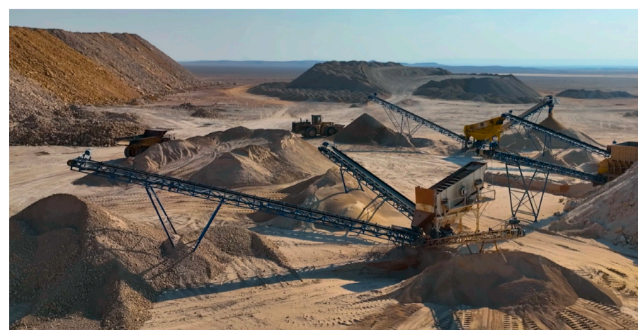
Production sites of the Jordan Phosphate Mines Company in Al Shediye

According to official figures, the mining and quarrying sector contributes about 2.2 per cent of GDP, valued at around JD700 million, and is expected to reach JD2.1 billion within the next decade. Exports currently stand at around JD1