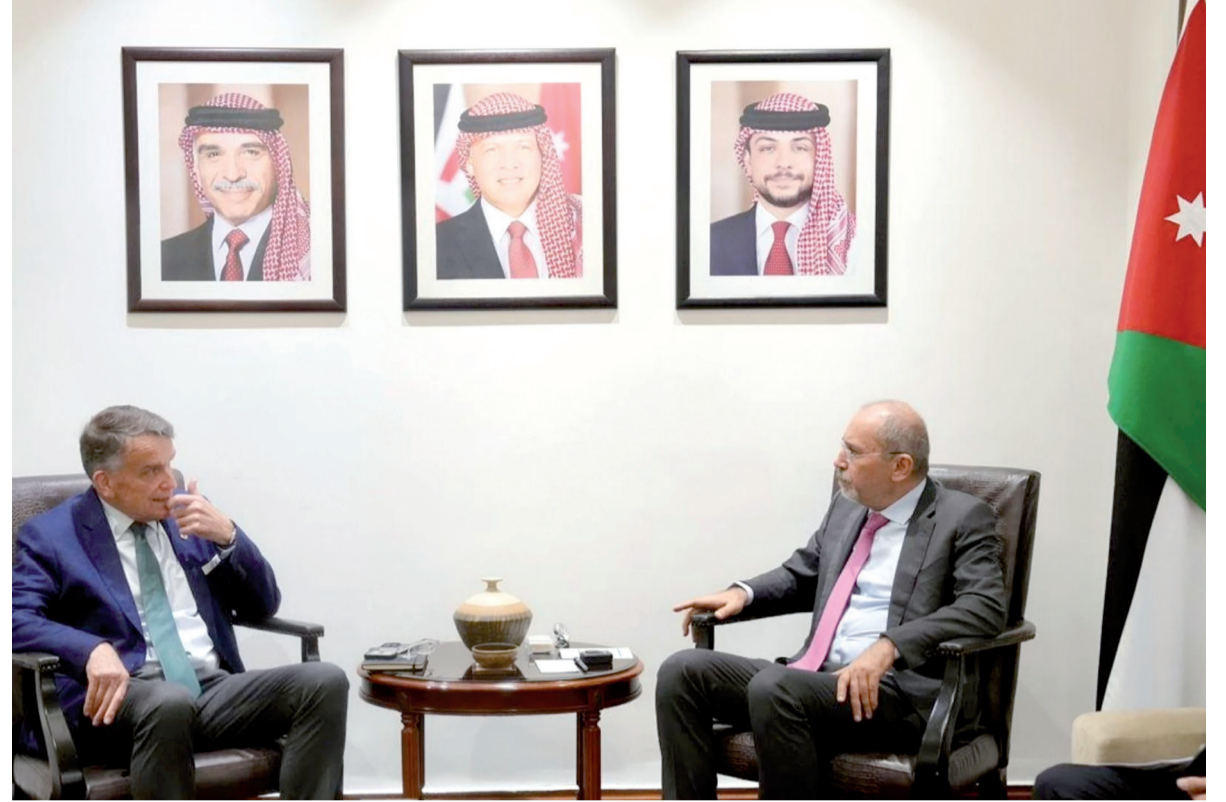
Deputy Prime Minister and Minister of Foreign Affairs Ayman Safadi and Acting UNRWA Commissioner General Christian Saunders on Wednesday discuss efforts to secure the support needed for the agency to maintain its vital services for Palestinian refugees

Safadi reiterated that UNRWA plays an indispensable role in providing essential services to Palestinian refugees, stressing that its work cannot be replaced, according to a Foreign Ministry statement.