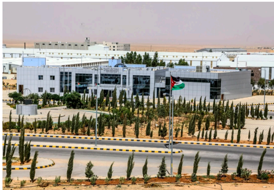
The Muwaqqar Industrial Estate, located approximately 35 kilometres southeast of Amman, is one of the Kingdom's key industrial zones

The export-to-import coverage ratio improved to 59 per cent, up from 53 per cent a year earlier, reflecting a 6 percentage-point increase.