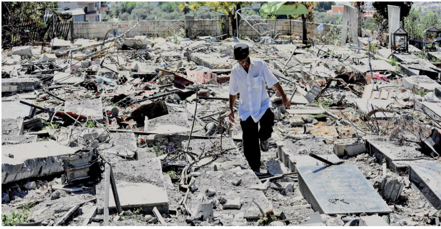
A man walks between damaged headstones, destroyed in Israeli military strikes, at the cemetery in the southern Lebanese village of Sriba on Wednesday