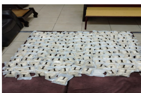
The Anti-Narcotics Department on Wednesday says it foiled an attempt to smuggle a large quantity of narcotic pills into the Kingdom