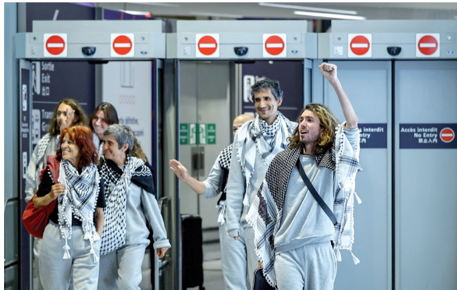
French activists detained and deported by Israel following the interception of their Gaza-bound flotilla arrive at Roissy Charles de Gaulle airport near Paris on May 22

were taken from the boat and violently herded together at sea onto what some called the "torture prison ship".