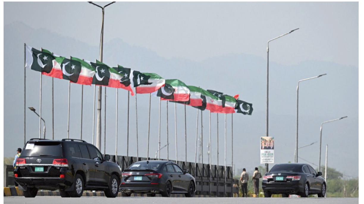
The motorcade of Iran's President Masoud Pezeshkian makes its way upon his arrival in Islamabad on Tuesday amid US-Iran peace talks

Meanwhile, Mohammad Bagher Ghalibaf, the head of the Iranian negotiating team, said on Wednesday that the