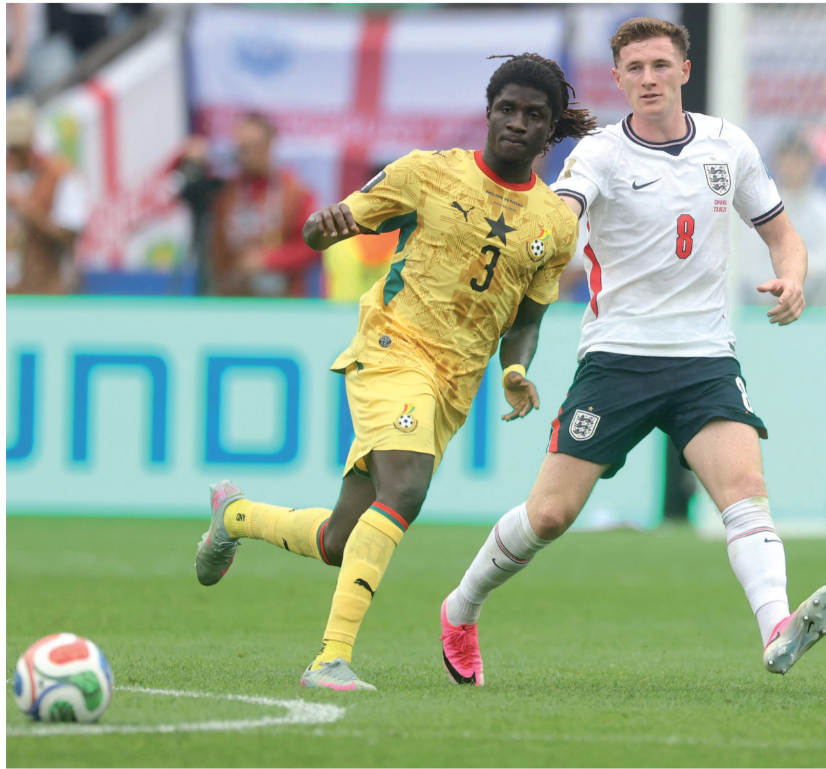
Caleb Yirenkyi #3 of Ghana and Elliot Anderson #8 of England during the FIFA World Cup 2026 Group L match between England and Ghana at Boston Stadium on Wednesday in Foxborough, Massachusetts