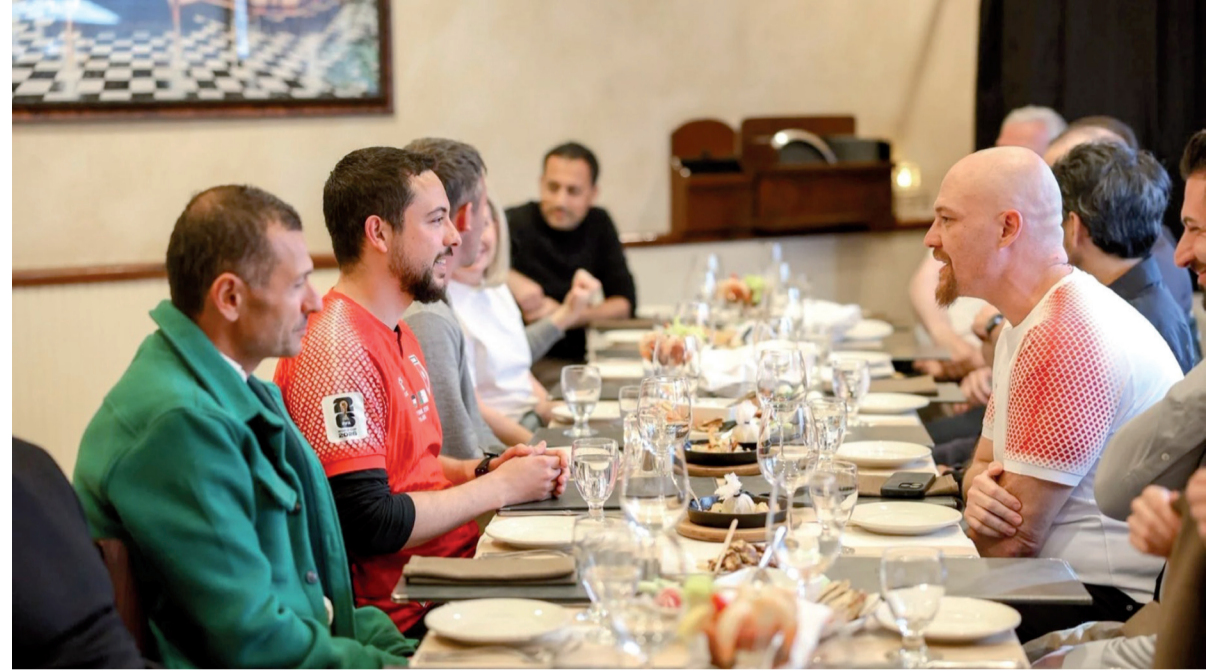
Crown Prince meets with entrepreneurs, executives of US technology companies

His Royal Highness noted that Jordan has become a regional hub for global technology companies such as Microsoft, Amazon, Oracle, and Samsung, thanks to the Jordanian talent working in the technology sector. Discussions also