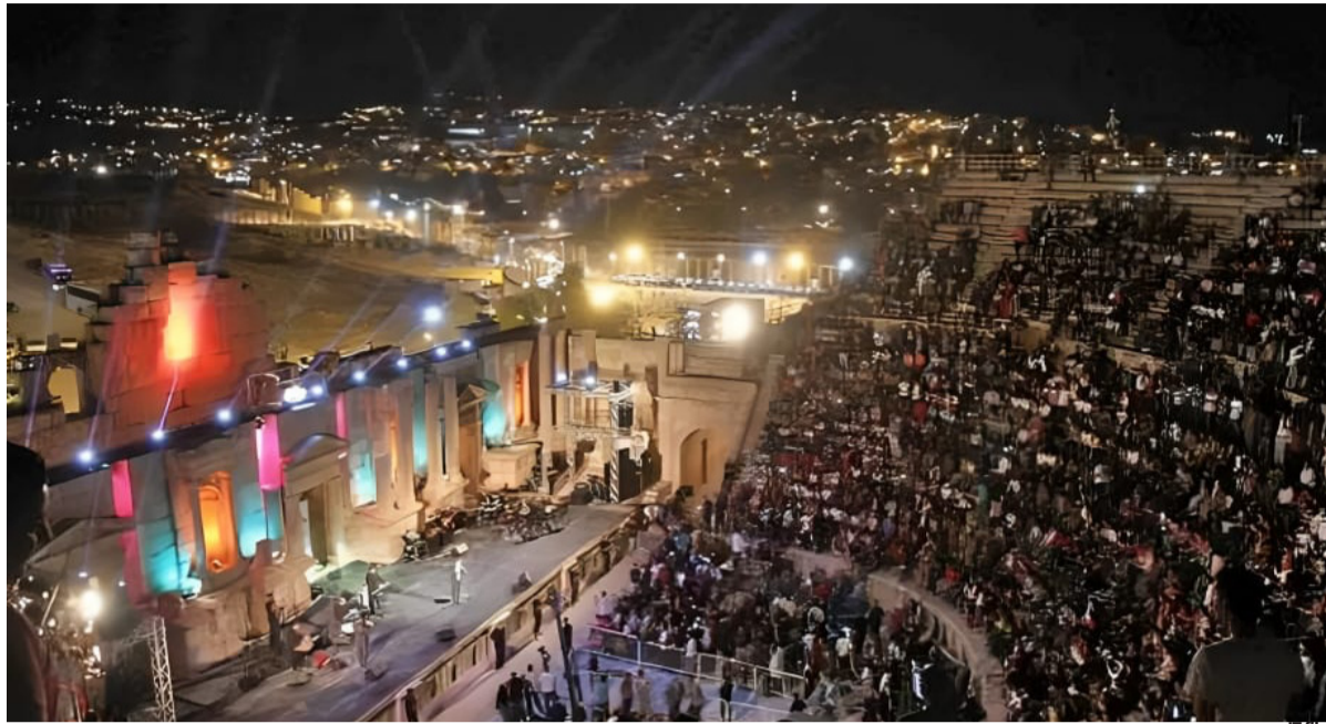
Jerash Festival opens 40th edition on July 22, under the slogan 'A Legacy That Endures... Generations Unite'

The South Theatre programme concludes on August 2 with a highly