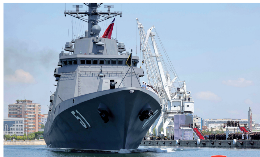
This photo taken on Tuesday and released by North Korea's official Korean Central News Agency on Wednesday shows the new-type multimission destroyer Choe Hyon departing after its commissioning ceremony at Nampo port in North Korea

Photos released by KCNA showed Kim saluting the Choe Hyon flanked by