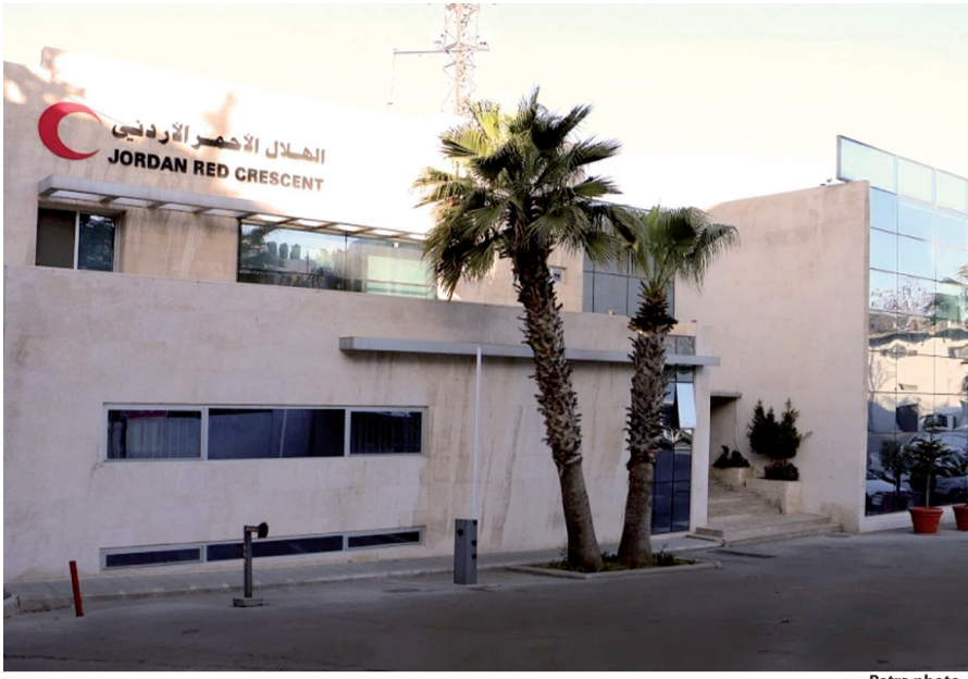
The Jordan Red Crescent Society on Wednesday says that the programme includes surgical procedures for patients evacuated from the Gaza Strip, rehabilitation services and prosthetic limb fitting