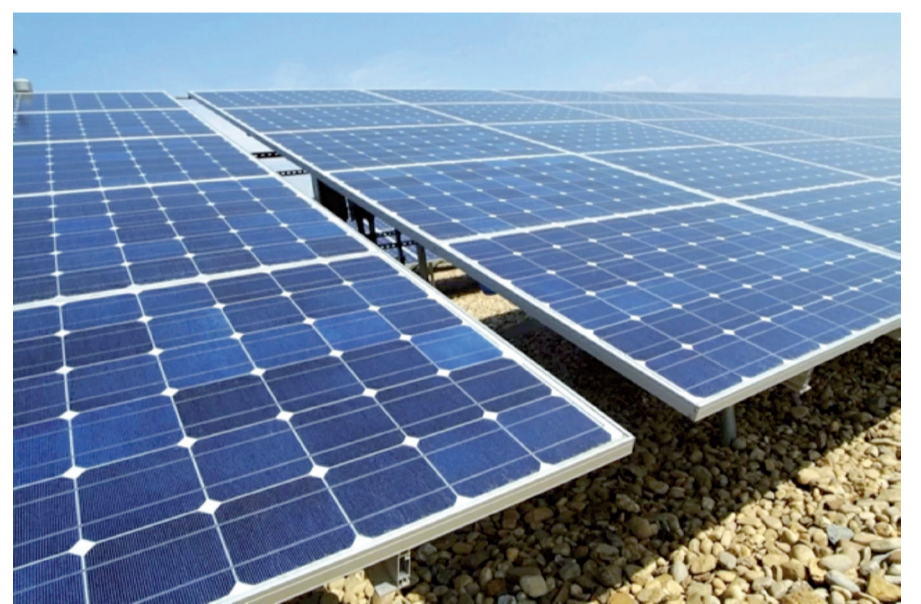
The Jordan Electric Power Company says that renewable energy systems connected to the grid surpassed 40,329 systems by the end of 2025

On European affairs, she said peace and stability remain a key priority for Ireland as it prepares to assume the presidency of the Council of the European Union for six months starting July 1, noting that its priorities will focus on values, economic prosperity and security.