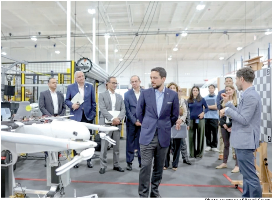
HRH Crown Prince Hussein visits on Monday the headquarters of Zipline, a global leader in autonomous aerial logistics technology, based in California