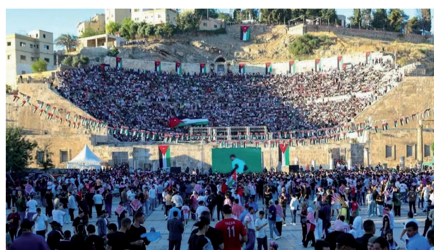
The Greater Amman Municipality on Monday announces providing free round-trip shuttle buses for fans wishing to attend the public viewing of the national football team's match against Algeria

AMMAN (JT) — The Greater Amman Municipality (GAM) on Monday announced providing free round-trip shuttle buses for fans wishing to attend the public viewing of the national football team's (Al Nashama) match against Algeria at the Roman Amphitheatre and the Hashemite Square. GAM called on fans to choose their nearest gathering point and adhere to the scheduled departure and return times to facilitate smooth access to the viewing venues, Al Mamlaka TV reported. The municipality stressed its full readiness to receive crowds, calling for broad participation to support and cheer for the national team under the slogan: "Be on time... let's cheer for the Nashama with one voice." The national team concluded its technical