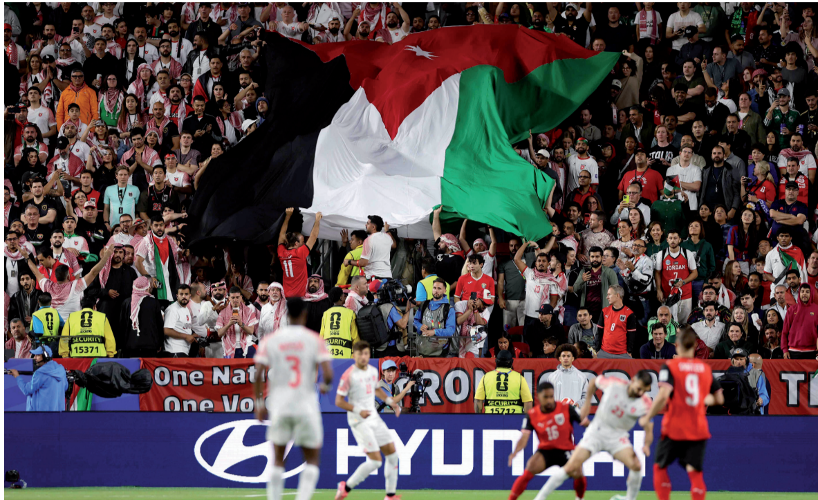
Fans of Jordan spread the big national flag during the FIFA World Cup 2026 Group J match between Austria and Jordan at San Francisco Bay Area Stadium on June 16 in Santa Clara, California