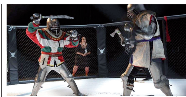
The fights were held in a local club that organises this kind of armoured combat

Scientists in the meantime are trying to find ways to neutralise the fish's deadly toxin — which can cause paralysis, respiratory failure and death — in order to make it marketable.