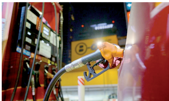
A car is refuelled at a petrol station with a 600-baht $18.5 maximum purchase in Bangkok on Tuesday

Meanwhile maritime traffic in the Strait of Hor-