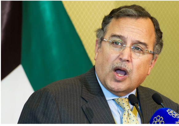
Nabil Fahmy, when Egypt's Foreign Minister, speaks in Kuwait City on January 15, 2014