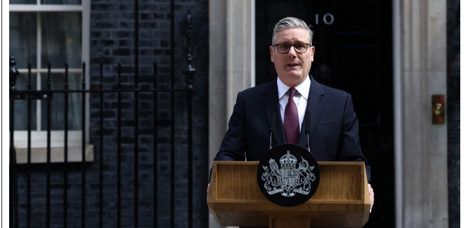
Britain's Prime Minister Keir Starmer makes a statement on his future outside 10 Downing Street on the morning of Monday, in London

Scientists have shown that recurring heatwaves are a clear marker of global warming and warn they are set to become more frequent, longer and more intense. Meteo-France says that of the 51 heatwaves recorded nationwide since 1947, 34 have taken place since 2000 and 26 since 2011.