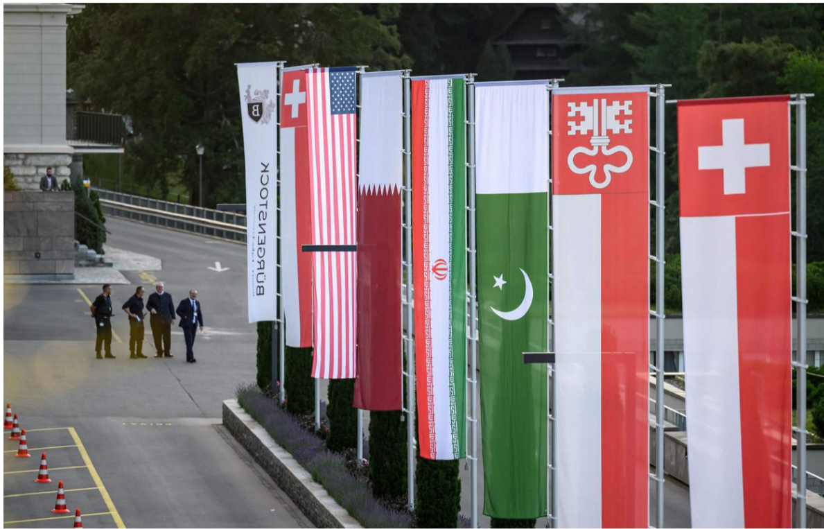
Flags of Switzerland, United States, Qatar, Pakistan and local Swiss canton of Nidwalden are photographed at the Burgenstock luxury hotel complex overlooking Lake Lucerne, Switzerland, on Sunday, ahead of high-level talks

The United States and Iran "agreed on the creation of a de-confliction cell, between the parties, the Lebanese Republic and facilitated by the Mediators, to ensure the adherence of the termination of military operations in Lebanon",