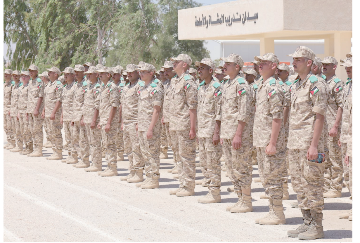
The assistant for administration and human resources on Monday inaugurates the training course for the second cohort of conscripts for National Military Service programme

During the meeting, the Crown Prince said that young Jordanians must be prepared to serve and defend their country, adding that citizens who have participated in national military service understand the importance of this experience. Attending the graduation ceremony of the first cohort of the National Military Service programme for 2026 in