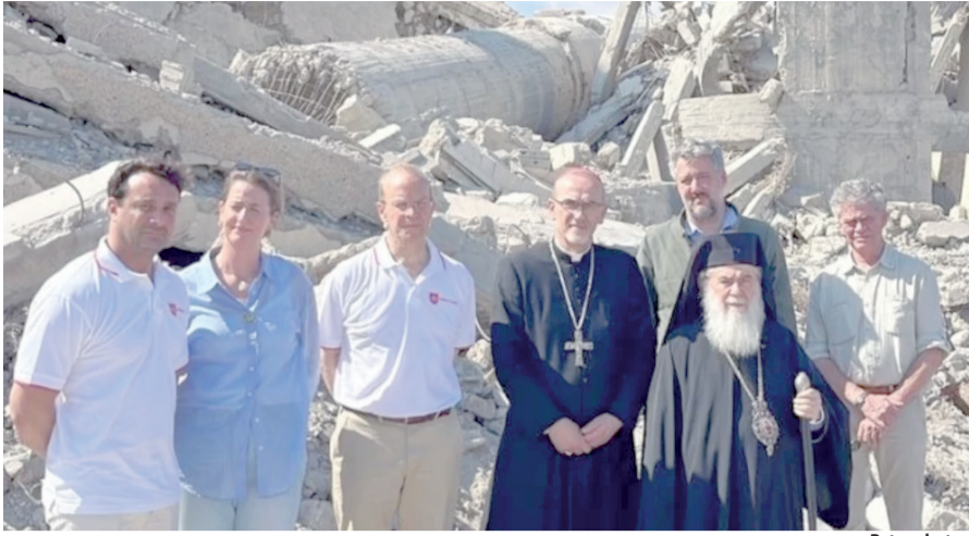
Patriarch Theophilos III of the Holy City of Jerusalem and All Palestine and Jordan and Latin Patriarch of Jerusalem Cardinal Pierbattista Pizzaballa on Monday arrive in the Gaza Strip for a pastoral visit