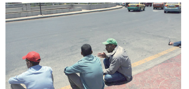
The Social Security Corporation on Monday announces a new mechanism that enables non-Jordanian workers to claim their insurance entitlements upon their final departure from the Kingdom

AMMAN (JT) — The Social Security Corporation (SSC) on Monday announced a new mechanism that enables non-Jordanian workers to claim their insurance entitlements, including lump-sum compensation, upon their final departure from the Kingdom. The move comes in implementation of a Cabinet decision to regularise the status of non-Jordanian workers from June until the end of September, according to a SSC statement. The SSC said that the new mechanism is designed to streamline procedures for workers leaving the country permanently, allowing them to submit claims online through its e-services platform without the need to visit the Ministry of Labour or obtain prior approvals.