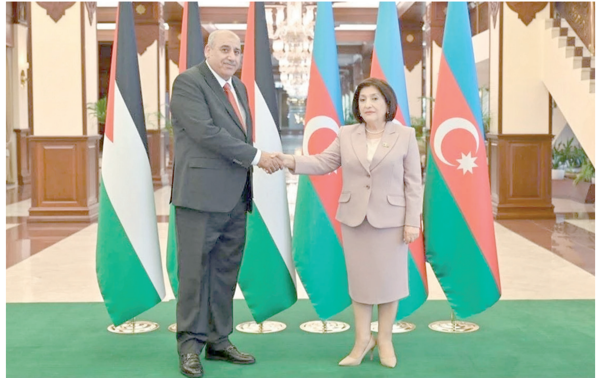
Lower House Speaker Mazen Qadi on Monday holds official talks with Speaker of the National Assembly of Azerbaijan Sahiba Gafarova

mentary cooperation must move beyond traditional frameworks towards an effective institutional partnership that supports economic and developmental legislation and strengthens coordination in parliamentary and international forums, positively impacting development and stability efforts.