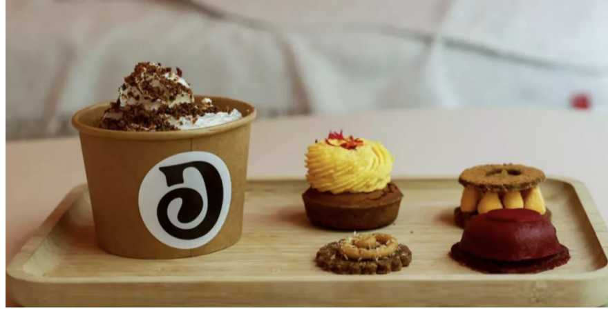
A trained pastry chef prepares the treats at this Paris dog bakery

"I thought it was a shame there weren't places in Paris where,