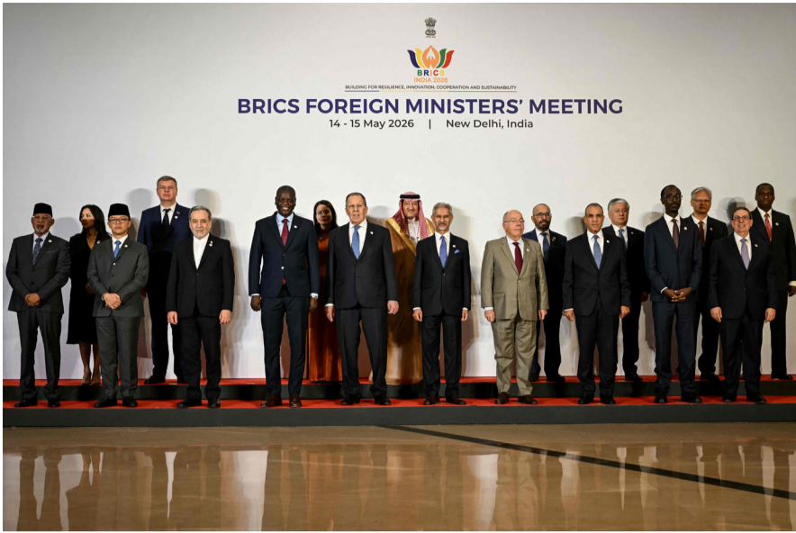
Delegates of partner countries during the BRICS Foreign Ministers' meeting at the Bharat Mandapam in New Delhi on Thursday