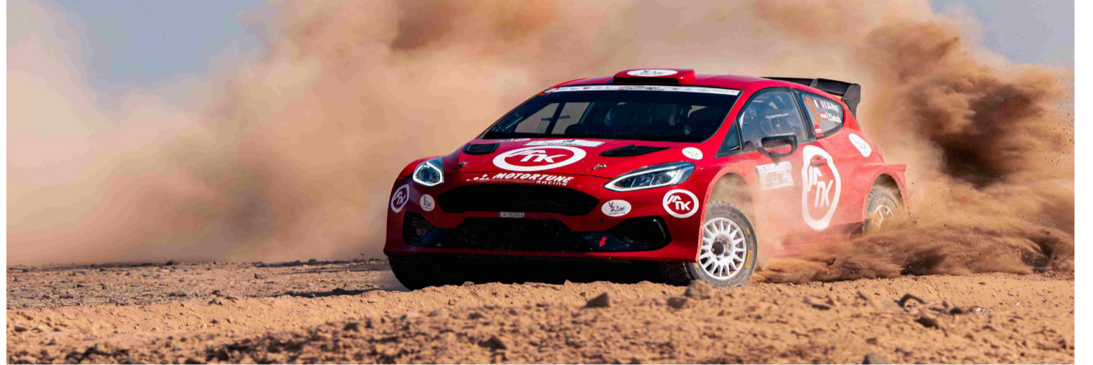
Competitors will tackle 12 special stages covering 196.80 competitive kilometres in a total route of 557.11km through the Jordan Valley and Dead Sea regions