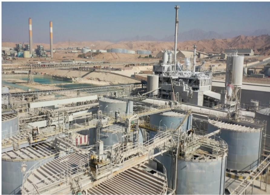
Industrial production quantities rise by 2.5 per cent in March according to the Department of Statistics