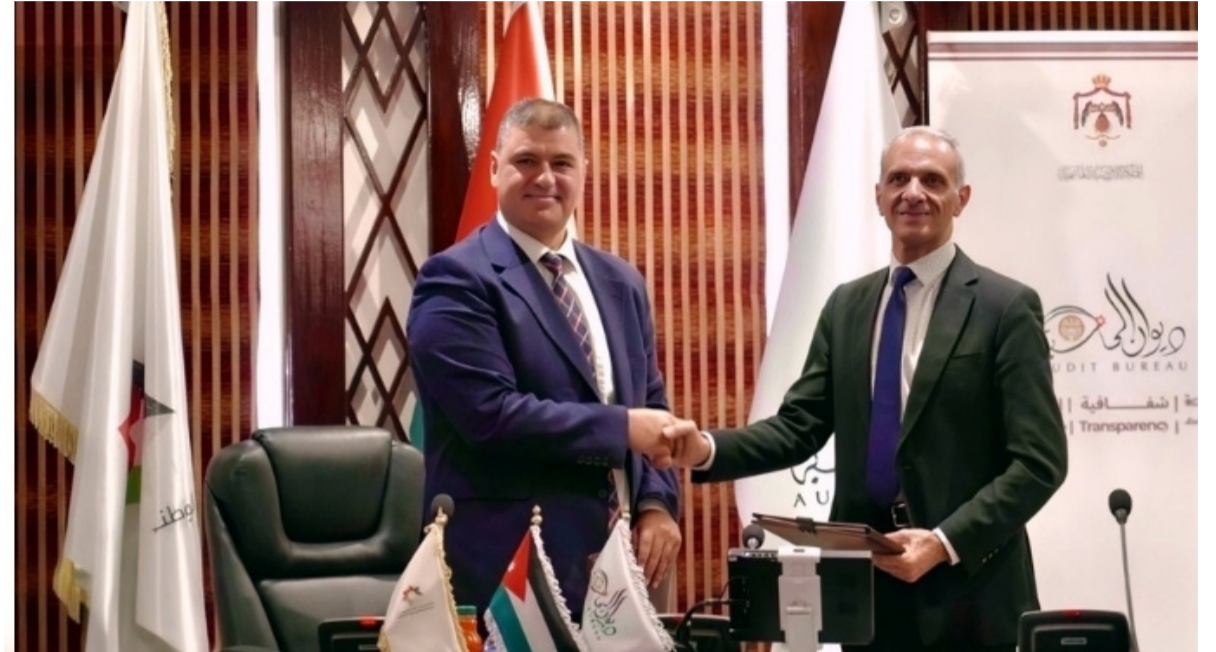
توقيع مذكرة تفاهم بين ديوان المحاسبة والمركز الوطني للأمن السيبراني 14/05/2026

He said that the strategic plan involves building partnerships with international and national bodies to empower auditors in electronic auditing, adding that these initiatives