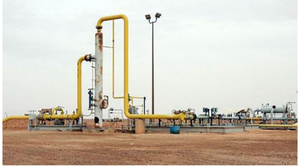
The National Petroleum Company (NPC) says on Thursday that production at Risha gas field has increased from 7.5 million cubic metres to 80 million cubic metres following efforts to expand production capacity and drill new wells after years of slowdown

He noted that NPC signed a contract with Kuwait Drilling Company and is also working to increase the quantities of gas extracted from the field while diversifying its customer base for natural gas.