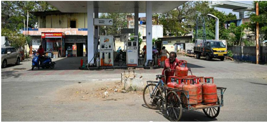
A delivery person carrying liquefied petroleum gas cylinders walks past a gas station in Chennai on March 11

However, it has increased prices of liquefied petroleum gas (LPG) — a primary cooking fuel in India — after disruptions following the US-Israeli strikes on Iran that led to Iran's near-total blockade of the strategic Strait of Hormuz. Delhi Chief Minister