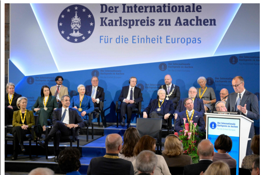
German Chancellor Friedrich Merz (right) gives a speech during a ceremony to award the former president of the European Central Bank (ECB) and former Italian prime minister Mario Draghi (centre) on Thursday in Aachen, western Germany