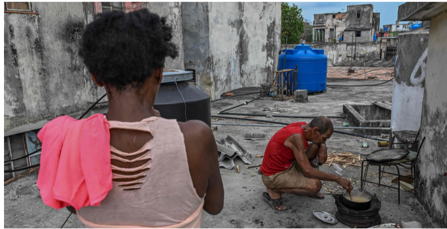
A man cooks with firewood during a blackout in Havana on Wednesday

Trump — who since the start of the year has