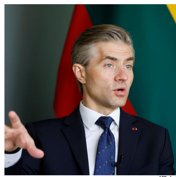
Lithuanian Foreign Minister Kestutis Budrys speaks during an interview with AFP in Vilnius, Lithuania, on Thursday

mitted to cross-European defence — being the second country in the EU after Poland to sign a European loan programme allocating over 6.3 billion euros ($7.35 billion) in funds to its military, and permanently stationing a brigade of 4,800 German soldiers on its territory.