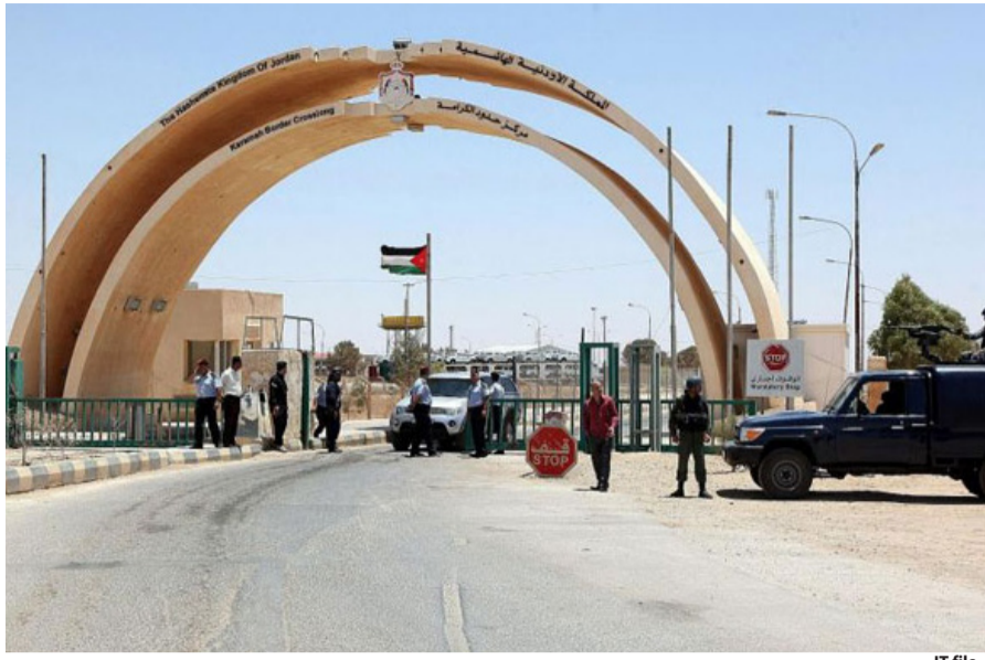
Freight movement through the Karamah Border Crossing has surged following a decision to extend operating hours at the crossing