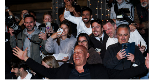
US actor Vin Diesel reacts as he arrives for the screening of the film 'The Fast and the Furious' at the 79th edition of the Cannes Film Festival in Cannes, southern France, on Wednesday

Diesel, 58, sounded surprised at the warmth of the tribute from Cannes