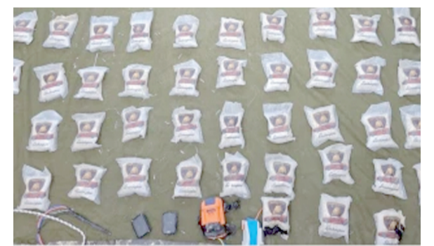
The Eastern Military Region command on Thursday foils an attempt to smuggle narcotics using electronically guided balloons

The balloons were detected by Border Guard units and brought down, along with their cargo, inside Jordanian territory in coordination with security agencies and the Anti-Narcotics Department.