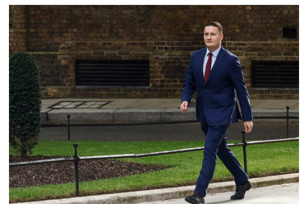
Britain's Health Secretary Wes Streeting arrives at Downing Street to meet with the prime minister in central London on Wednesday