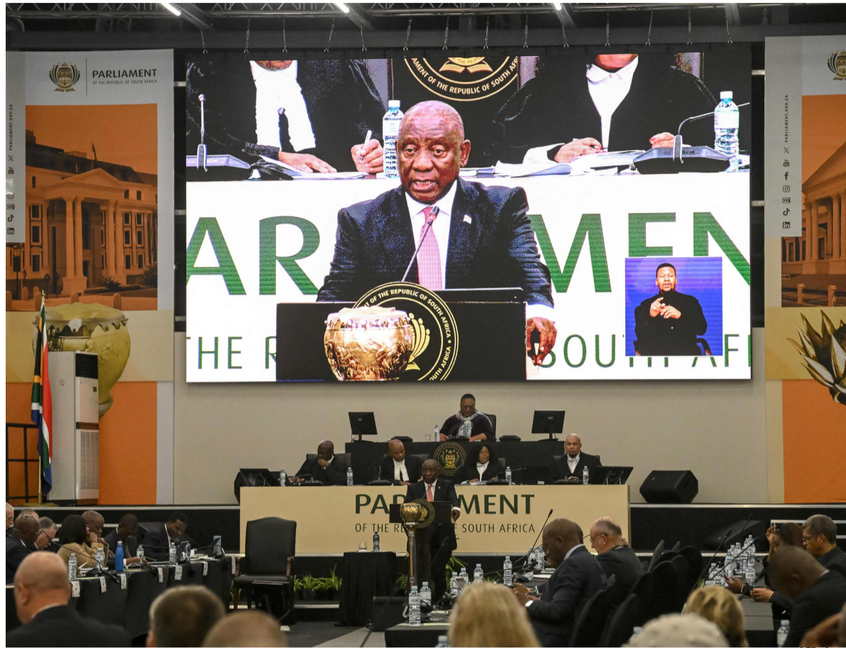
South Africa's President Cyril Ramaphosa (centre) answers questions in Parliament in Cape Town on Thursday

Other allegations involve irregularities over appointments in the ministry and claims that a state-funded employee at one of her homes was re-