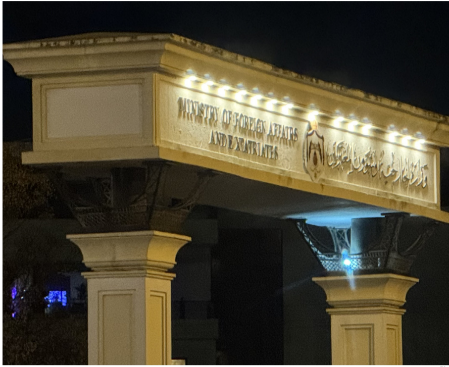
The Ministry of Foreign Affairs and Expatriates on Thursday welcomes an agreement reached by Yemeni parties under UN auspices to release more than 1,600 conflict-related detainees

Friday-Saturday, May 15-16, 2026 | Dhu al-Qadah 28-29, 1447 Hijri