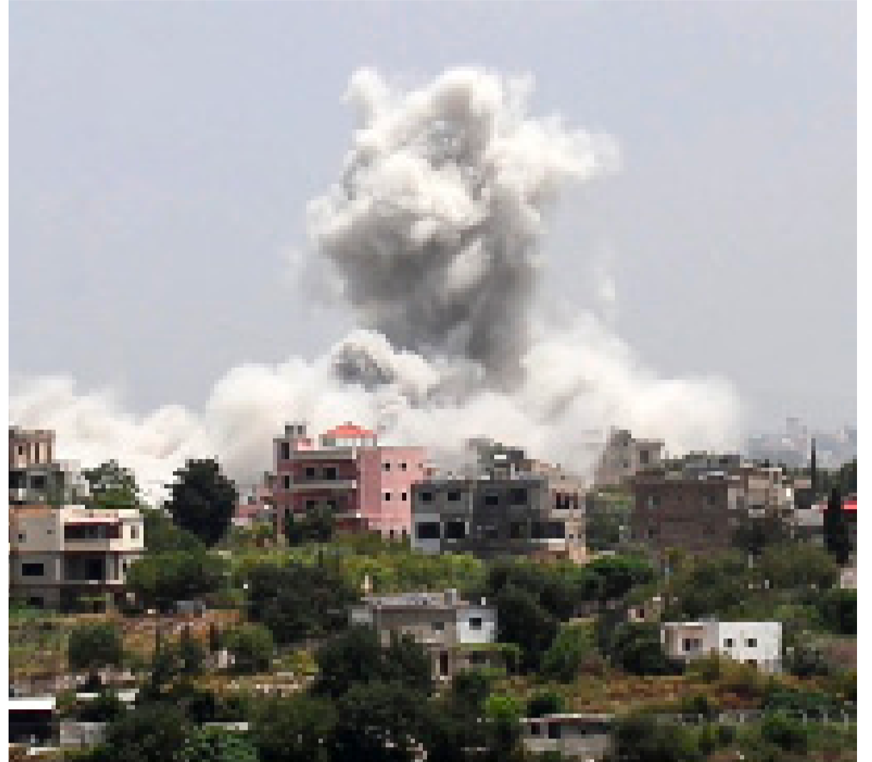
Smoke rises from the site of an Israeli air strike that targeted the southern village of Al Halloussiyah on Wednesday

Since US President Donald Trump announced on April 16 that the leaders of Israel and Lebanon had agreed to a ceasefire, Israeli strikes have killed more than 400 people in Lebanon, ac-